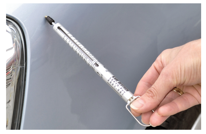
Thickness measurement on automobile paint coating (application example)